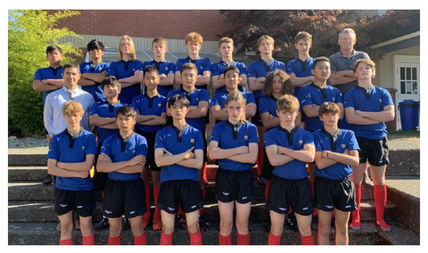
GRADE 9 BOYS RUGBY TEAM