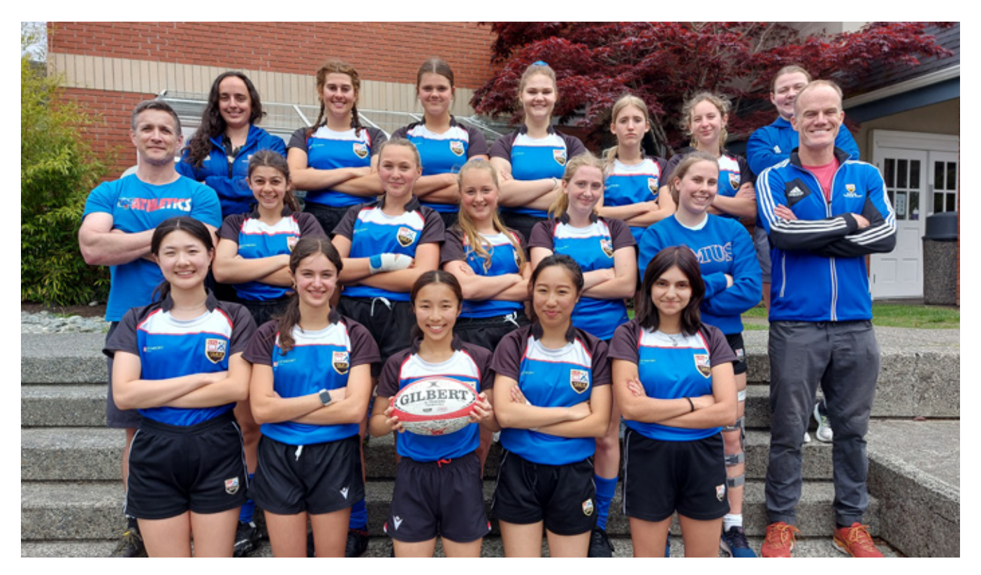
DEVELOPMENT GIRLS RUGBY