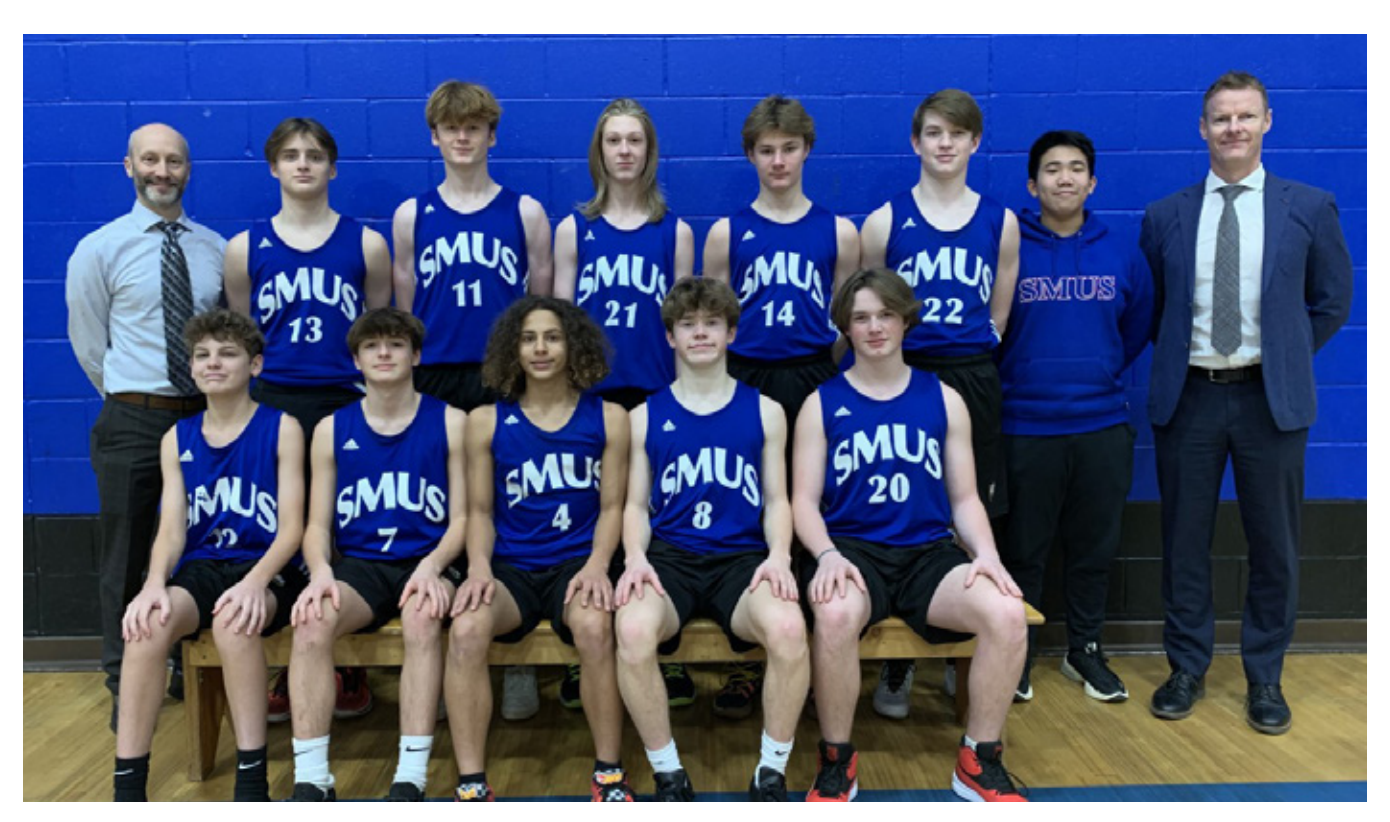
GRADE 9 BOYS BASKETBALL TEAM