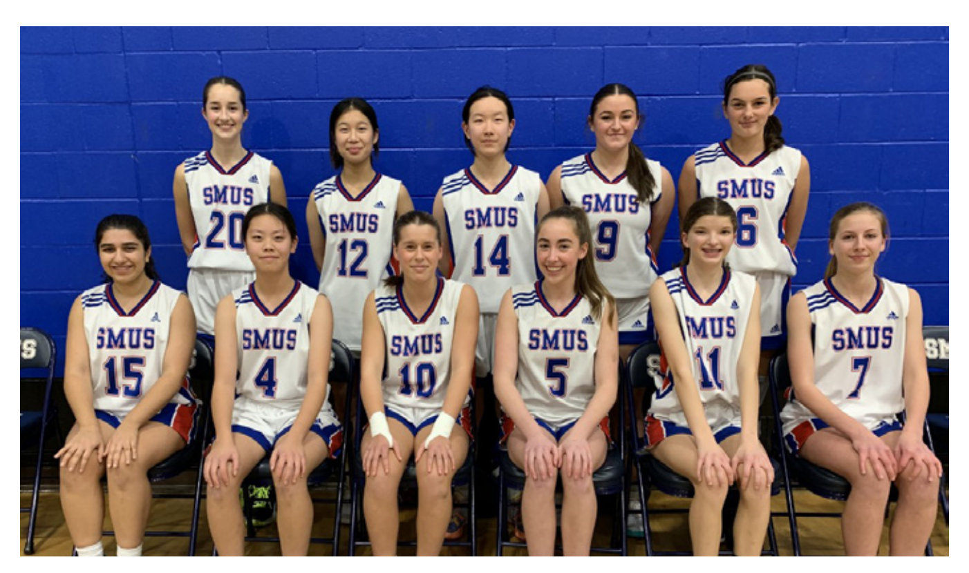
JUNIOR GIRLS BASKETBALL TEAM