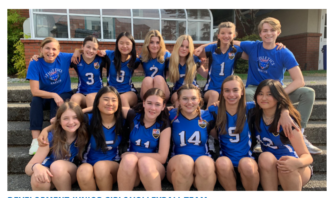
DEVELOPMENT JUNIOR GIRLS VOLLEYBALL TEAM