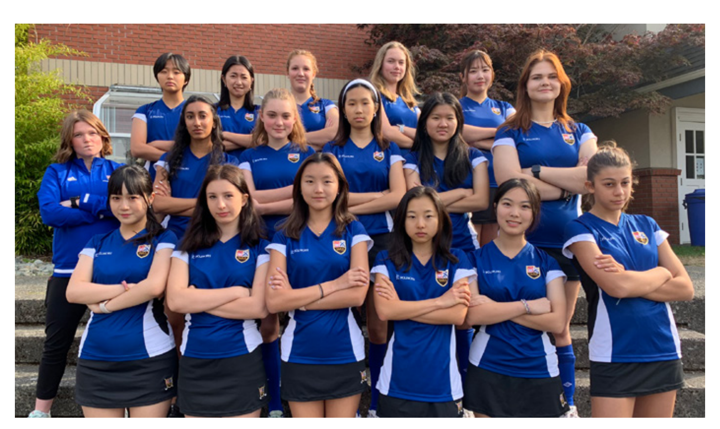
DEVELOPMENT FIELD HOCKEY TEAM