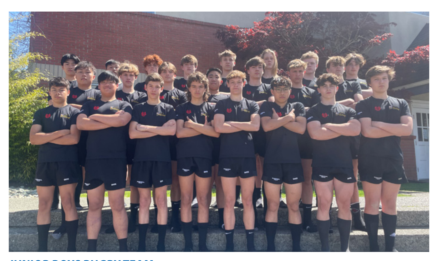
JUNIOR BOYS RUGBY TEAM