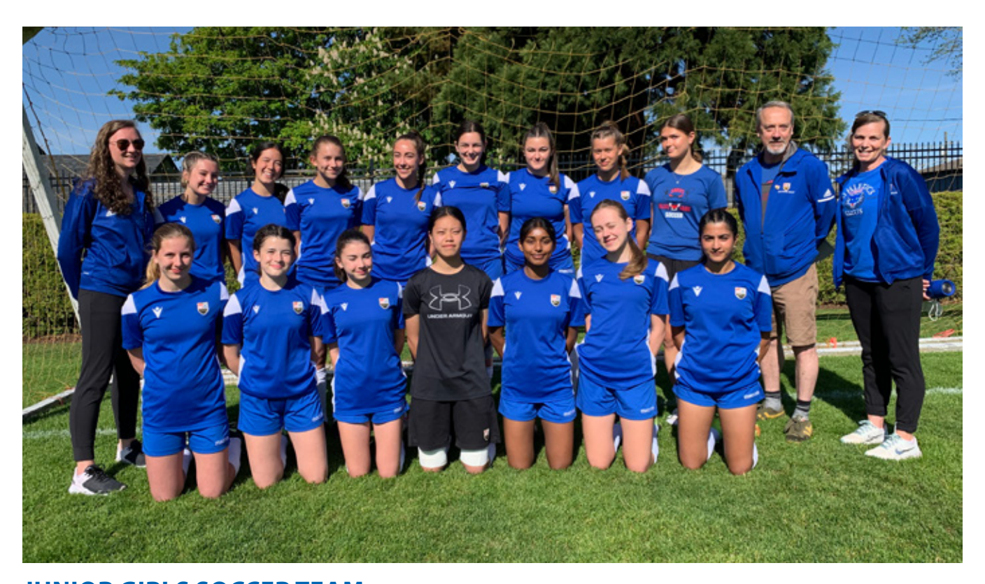
JUNIOR GIRLS SOCCER TEAM