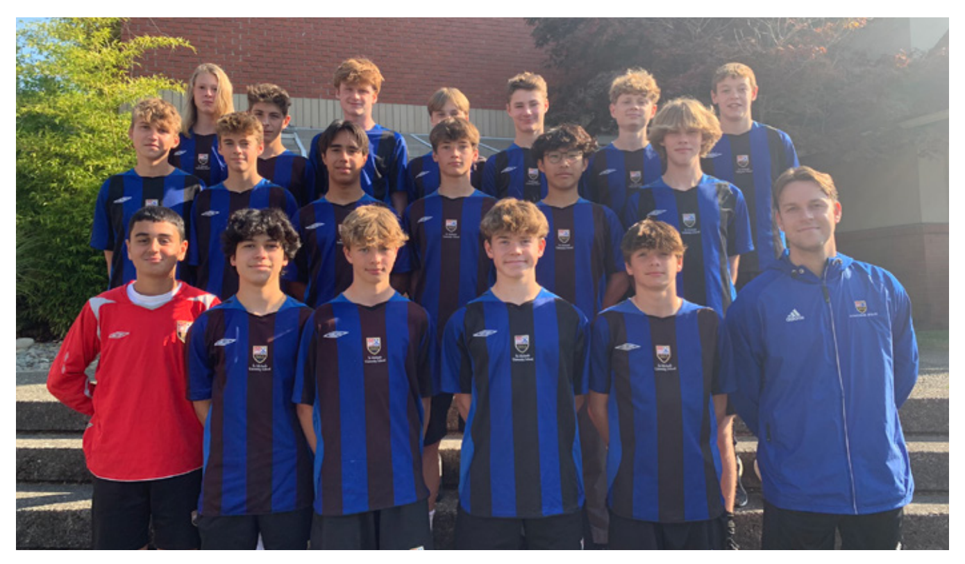
JUNIOR BOYS SOCCER TEAM