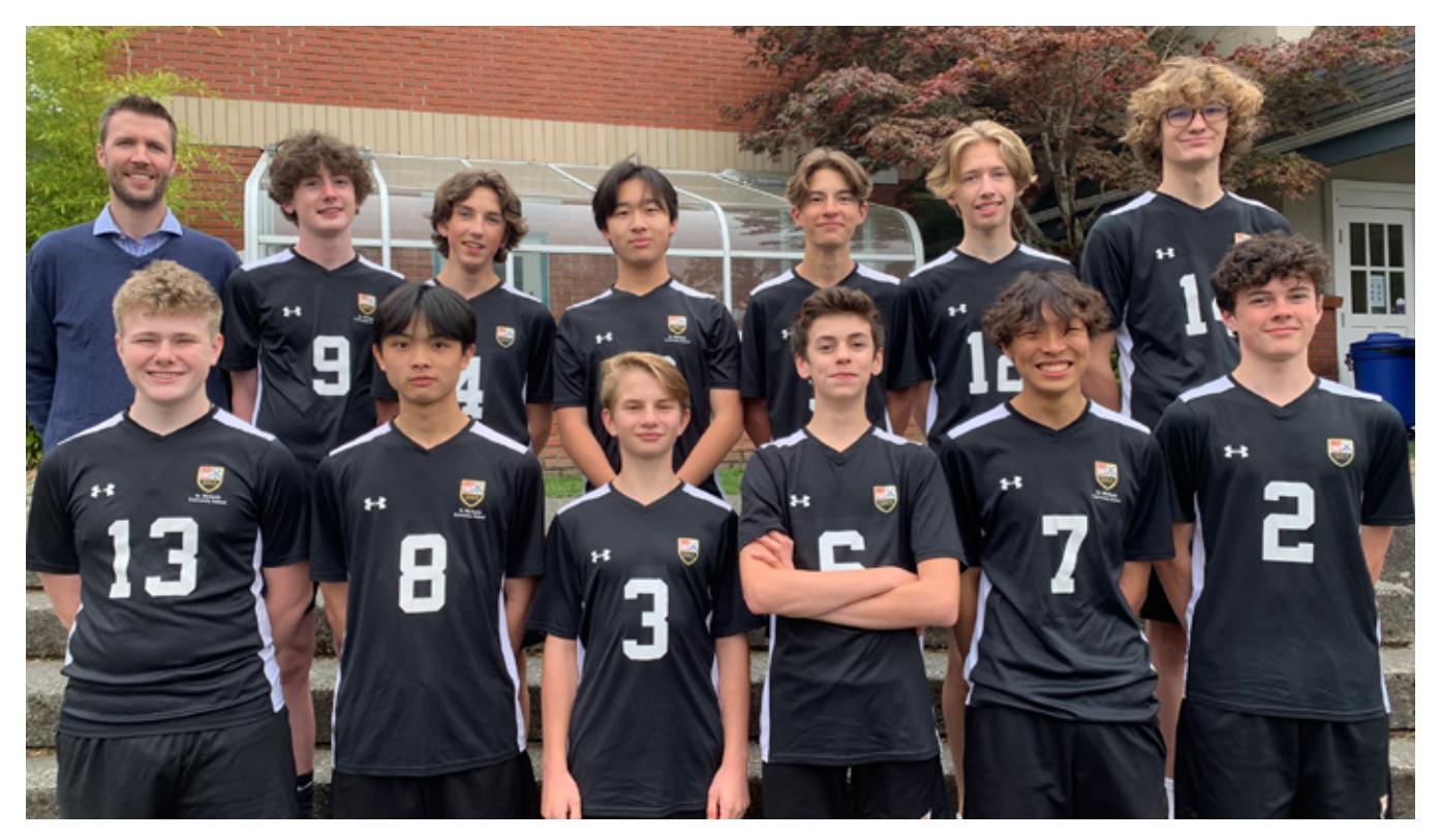
JUNIOR BOYS VOLLEYBALL TEAM