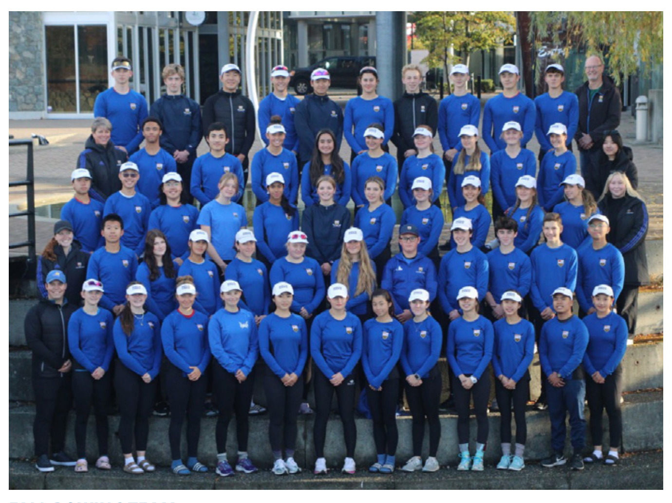
FALL ROWING TEAM