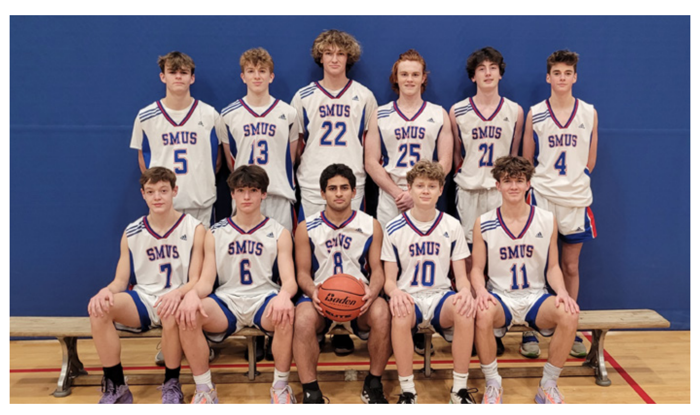
JUNIOR BOYS BASKETBALL TEAM