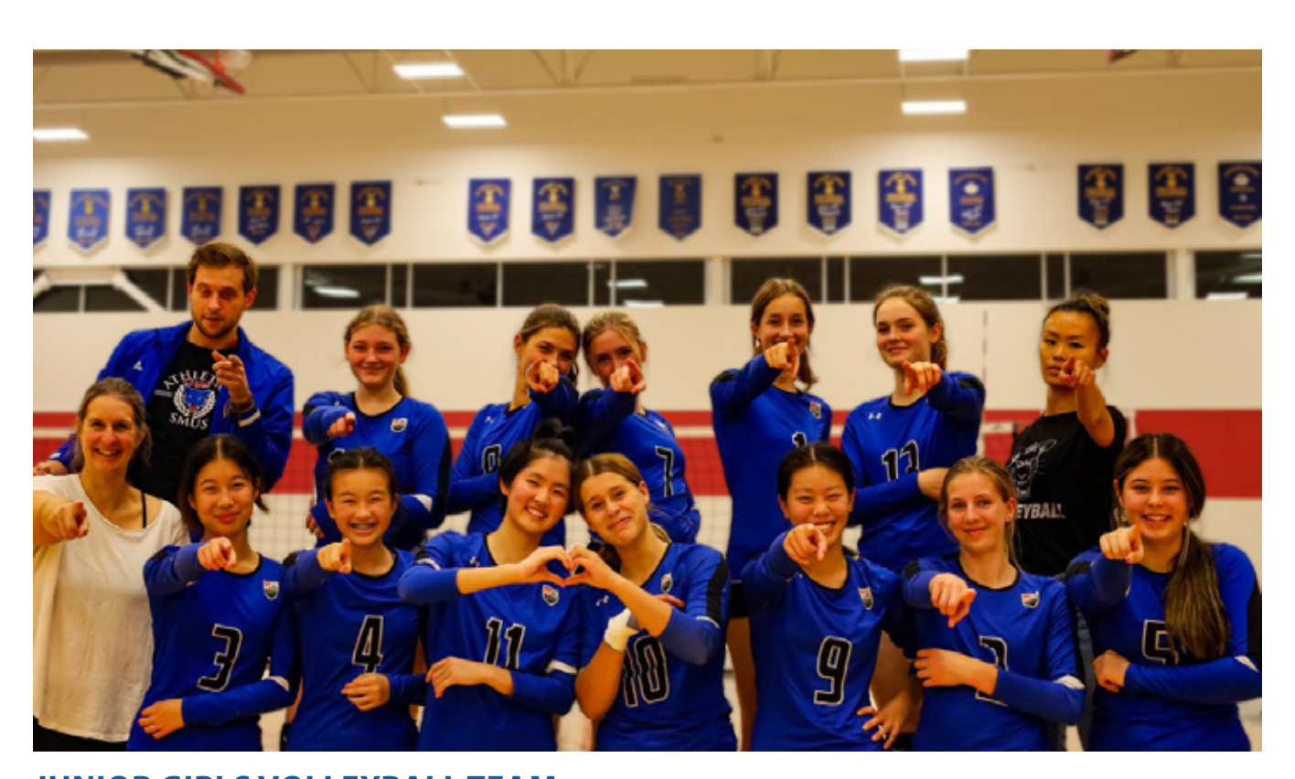
JUNIOR GIRLS VOLLEYBALL TEAM