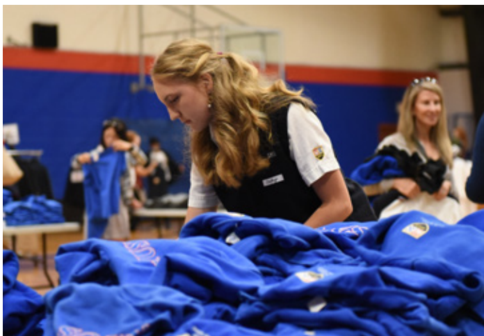
Used uniform sales are a substantial source of revenue for the PA.

Thank you to everyone who contributed their time and energy to the Parents' Auxiliary this past year. We look forward to another exciting year of supporting the school and our students in 2024-25.