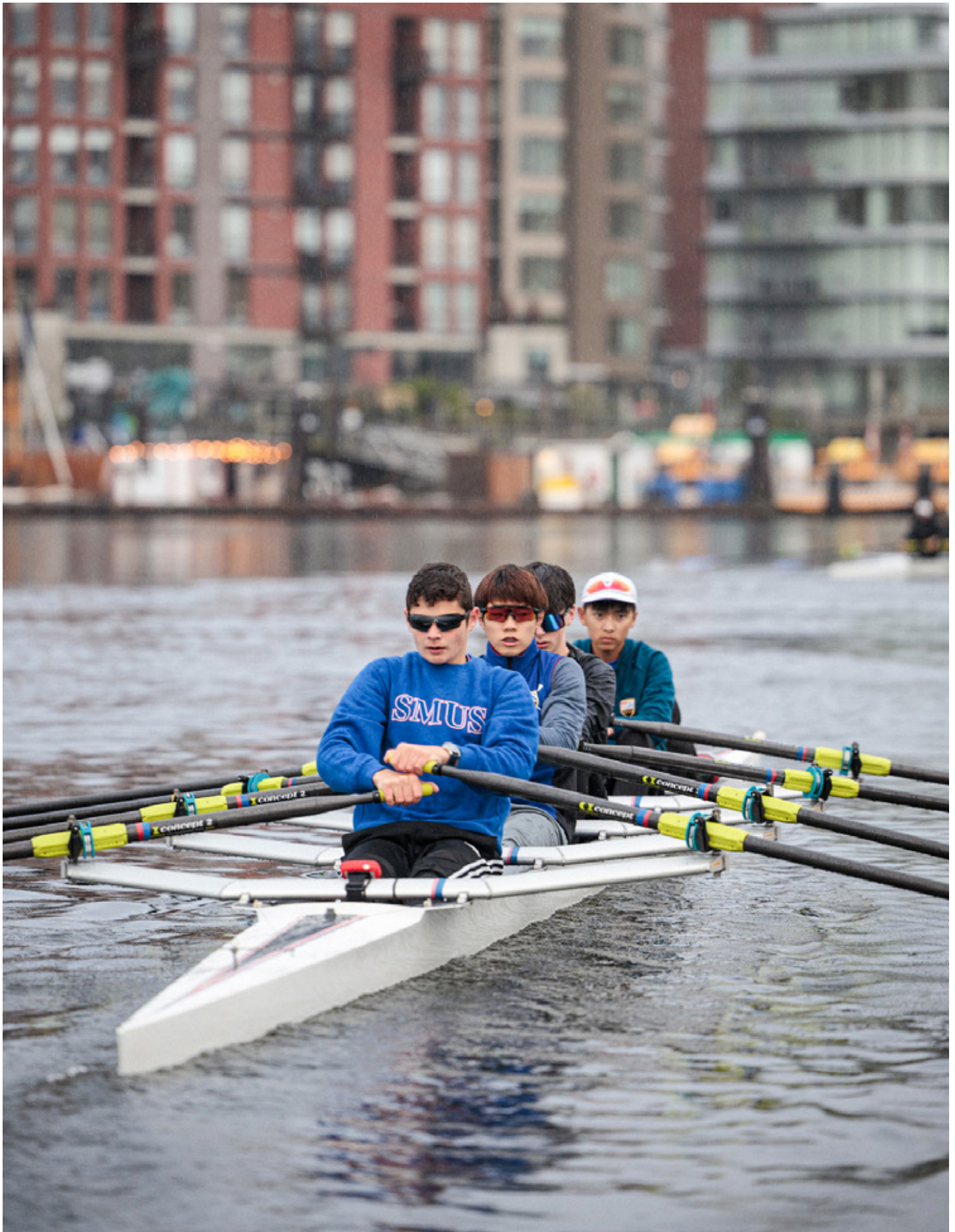
Rowing practice on the Gorge.