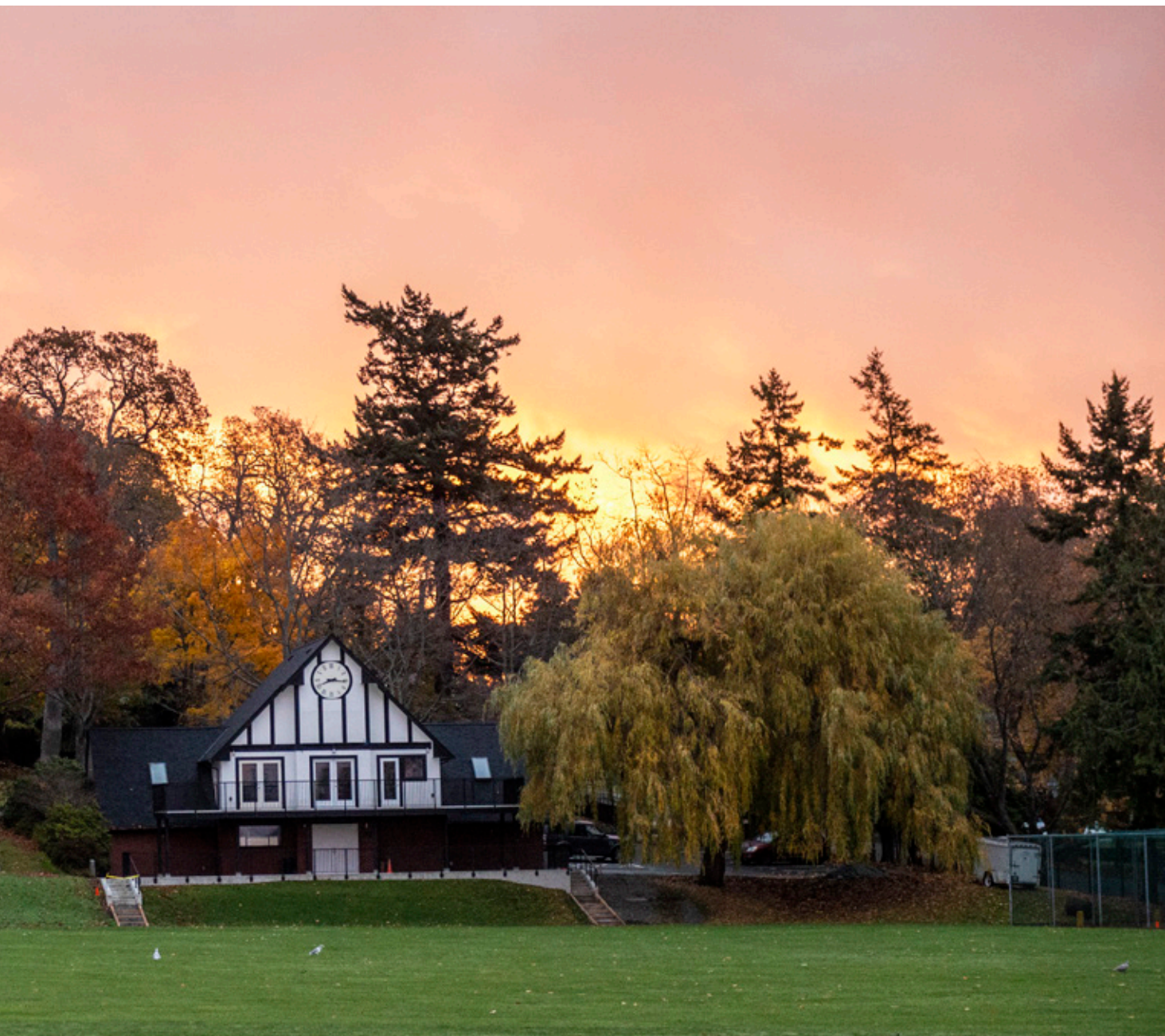
Sunrise colours over Reynolds House and the Wenman Pavilion.