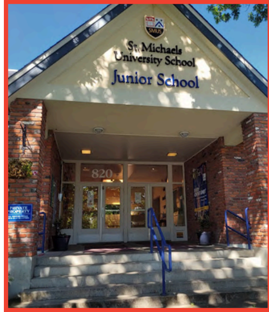
Junior School Campus 820 Victoria Avenue