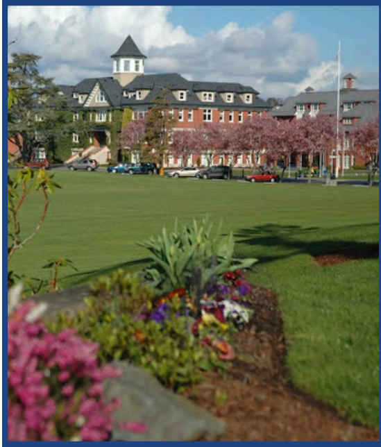
Richmond Road Campus 3400 Richmond Road